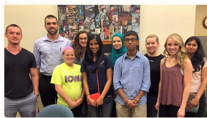
2016-17 ServiceCorps Scholars

Our scholars create and lead small service events all over Indianapolis! Last semester we got to go to 10 different community organizations ranging from helping animals, organizing donated books, and preparing hot meals for families in need.